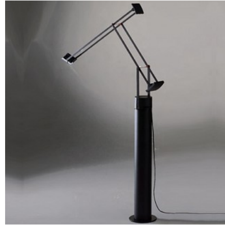
Design: Tizio Lamp Richard Sapper

Product Design is the most appropriate group to tackle the challenge