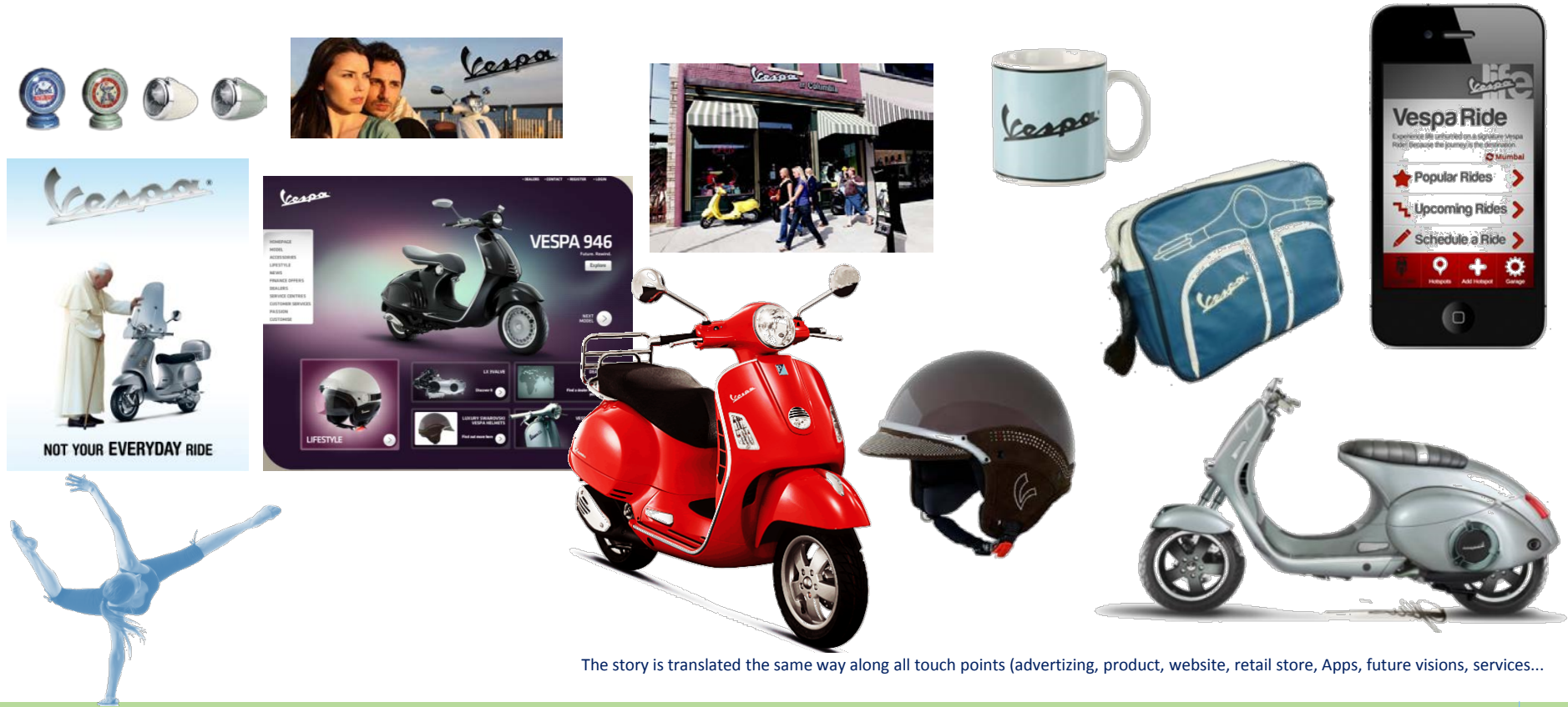
The story is translated the same way along all touch points (advertising, product, website, retail store, Apps, future visions, services...)