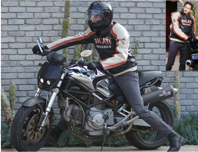
Adrien Brody Ducati