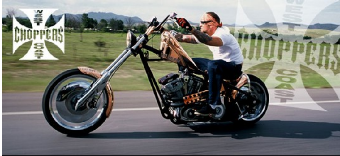
Jesse James West Coast Chopper